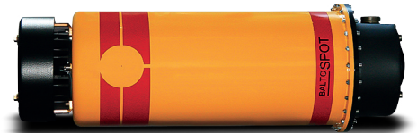
Balteau GFC 160C / GFC 200C / GFC 300C