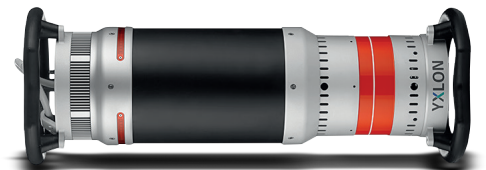
Yxlon/Comet EVO 200KV or EVO 300KV