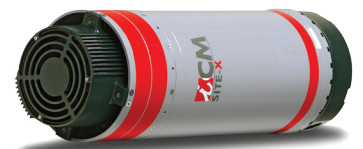
ICM SITEM 250KV-360KV

PROUDLY SUPPLYING THE NDT INDUSTRY FOR OVER 35 YEARS