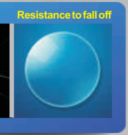
Special Optically PMMA Lens